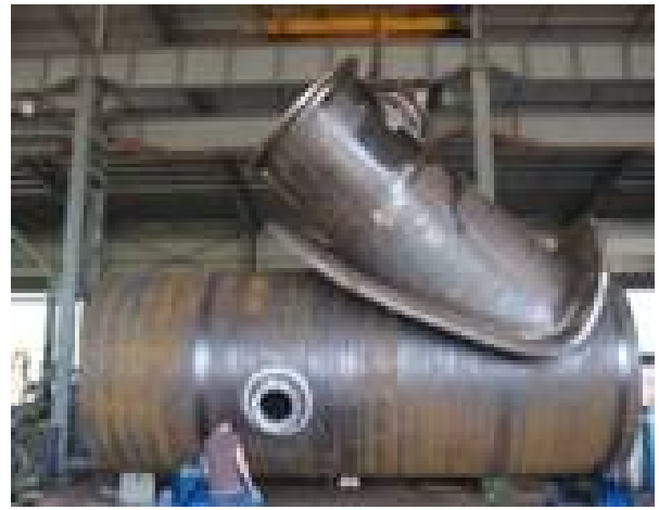
Richlands Facility: 6400m 2 under roof fabrication shop