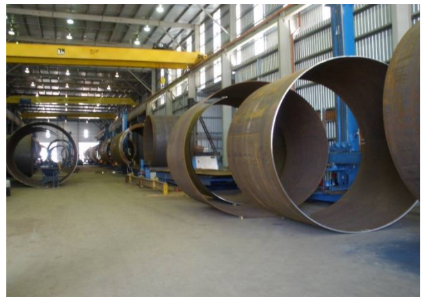
Dalby- Blast Bay 40mL x 8mW x 8.5mH Dalby- Paint Bay 40mL x 8mW x 8.5mH